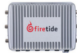
HotPort 7020 Outdoor Mesh Node

Firetide delivers the most secure and reliable private broadband wireless networks for managing and protecting your infrastructure and assets. Powered by our patented AutoMesh™ platform, our solutions are unrivaled at supporting inside and outside environments, handling mobile and fixed assets, and delivering live, high-bandwidth video feeds reliably, securely and with low latency.