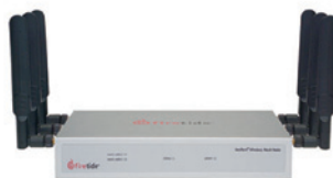
HotPort 7010 Indoor Mesh Node